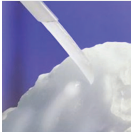
Deepchill™ cooling fluid is 100% recyclable and environmentally friendly.

Sunwell Technologies Inc., which is the global leader in variable state slurry ice (Deepchill™) production, storage and distribution, has developed refrigerated units that solely rely on Deepchill™ thermo batteries. The size of a refrigerated unit can vary between a small box and the size of a truck trailer. The Deep-