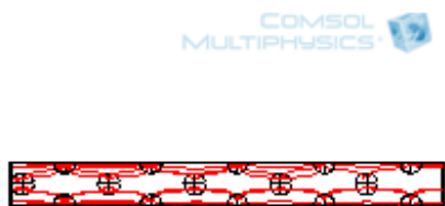
Figure 2 : The streamline plot