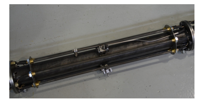
Figure 1: First generation heater design.